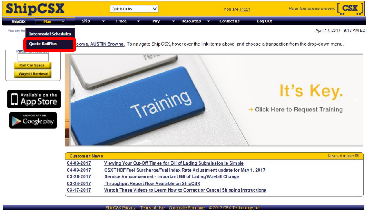
Figure 2: Select Options from the toolbar.